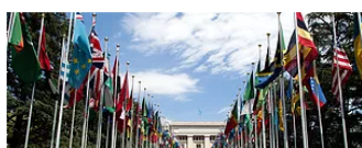
D.I. Embassy Services