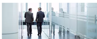
D.I. Personal Services