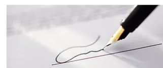
D.I. Private Diplomacy