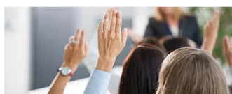
D.I. Community Services